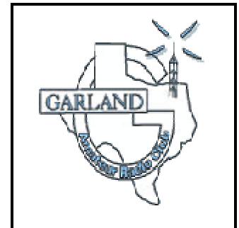
Where HAM RADIO IS FUN!!!