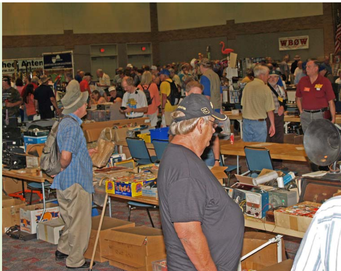
Inside the vendor area at Hamcom 2008.