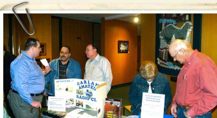
GARC Booth at Skywarn 2009