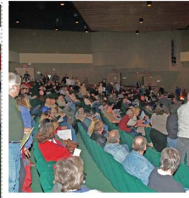
Quite a turn out