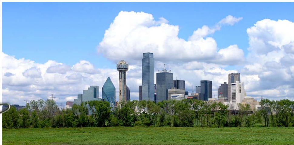
Downtown Dallas Looking North