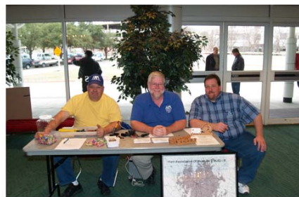
Ham Association of Mesquite Table